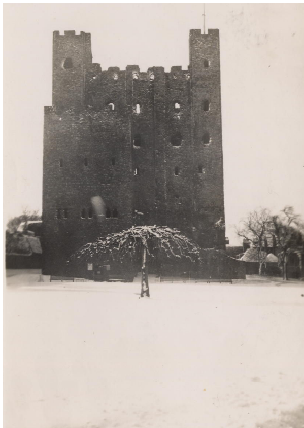
From the Medway Archives and Local Studies Centre Couchman Collection; ref. DE402/7/35(U); 5 3/8" x 3 3/8" (136mm x 87mm) Before 1939. Photograph of Rochester Castle gardens under snow, looking south across lawn area towards north face of castle keep, showing trees in middle ground and left and right distance.

The Friends of Medway Archives and Local Studies Centre wish you a very happy Christmas and a prosperous New Year