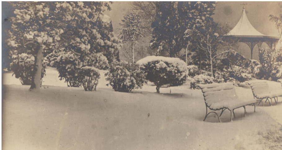
From the Medway Archives and Local Studies Centre Couchman Collection, ref.: DE402/7/34(L) Postcard photograph entitled Bandstand, Castle Gardens comprising view of Rochester castle grounds under snow looking from point adjacent to west side of long walk north-west towards bandstand, showing benches, shrubs, bushes and trees. c.1909