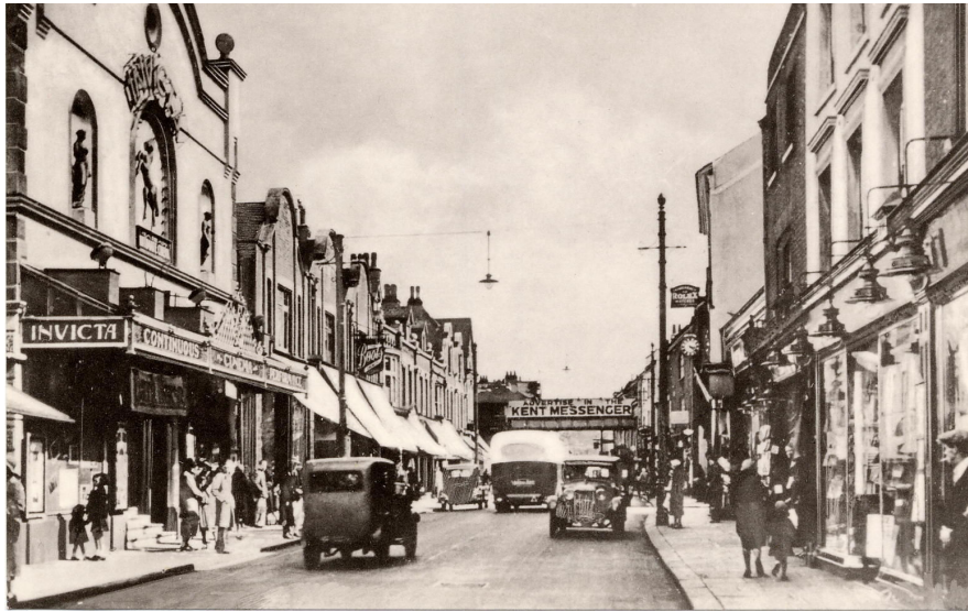
From the Medway Archives and Local Studies Centre Couchman Collection; ref. DE402/12/23: High Street (Watling Street, A2 trunk road), Strood. Reproduction postcard photograph of section of Strood High Street between North Street and Station Road, looking south-east towards railway viaduct (Medway Valley or North Kent Line), showing ranges of shops on north and south sides, including, left to right and clockwise, Invicta Picture

The walk begins at Strood Esplanade and past the Civic Centre, which was once the offices of Aveling and Porter, the makers of steam road rollers (see the route map above, commencing at number 1). The road leads you into the High Street which, before the advent of the M2 motorway took two way traffic onto London in one direction, or to the coast at Dover in the other. Many of the businesses mentioned in the leaflet have now gone. For instance, Collis and Stace the ironmongers is now a petrol station. There was also the Invicta Picture Palace (see below), one of three cinemas in Strood.