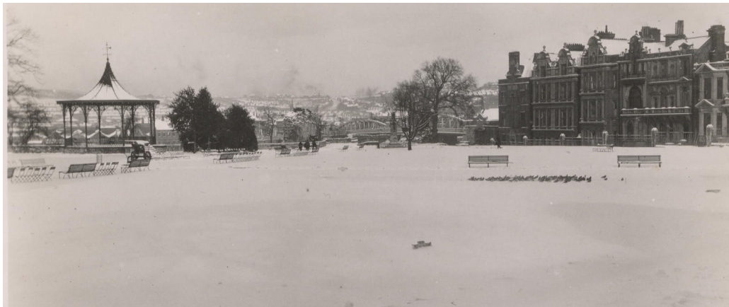
ref. DE402/7/34(U) Photograph looking north-west across Rochester Castle grounds under snow, showing from left to right, long walk running from left middle ground to centre distance lined with chairs and benches, bandstand, trees, remnant of Queen Victoria's 1887 jubilee memorial, boundary fence alongside Castle Hill and buildings on Castle Hill. Also visible in distance, Rochester Bridge and Strood. 5 3/4" x 3 3/4" (145mm x 95mm) c.1931 x c.1939