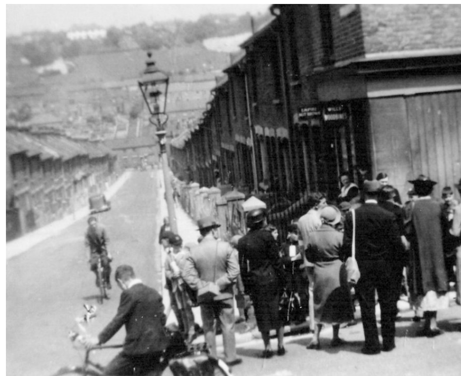
Parents waiting at the top of Edinburgh Road for their children to walk from school to the station on route to Wales (evacuation)

invasion. Sadly many stories also emerged of abuse and cruelty and when the anticipated bombing raids failed to happen - the so-called Phoney War of the autumn of 1939 - many children returned home.