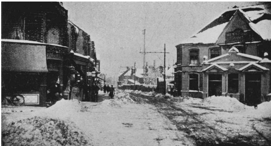
Canterbury Street Gillingham after snow 1909

Some samples from the Medway Images online database: