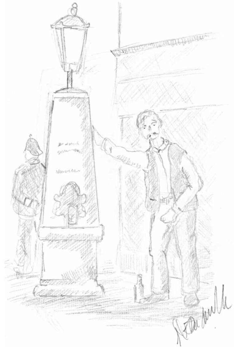
A drawing of the pump by Mick De Caville.

Long before the days of the Waterworks Company I have rendered valuable assistance in providing water to extinguish fires that have broken out in my neighbourhood. Relays of men took turns at pumping, and others formed a chain, passing the full buckets to the conflagration and another chain returning the empty ones.