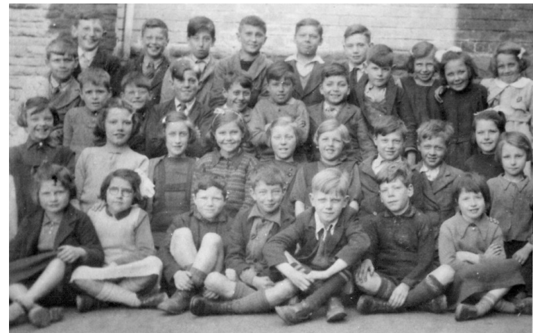
Boys and Girls Luton Council School at Abercarn Wales (evacuees)

In all, around 47,000 stories and 15,000 images were collected by the BBC, and they can be found on bbc.co.uk/ww2peopleswar . You can even search the archive by typing in a keyword – there are 39 results for 'Strood' alone!