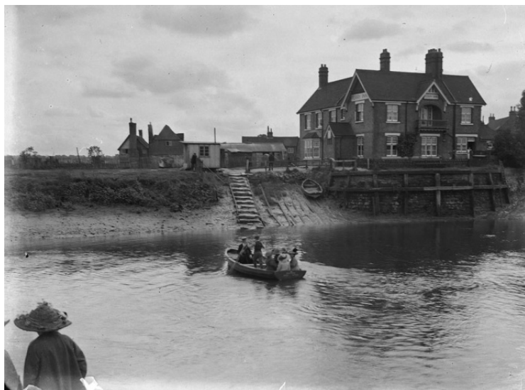
Ferry across River Medway at New Hythe (from Eccles). Ferry Inn now used as offices by papermill. c 1910.