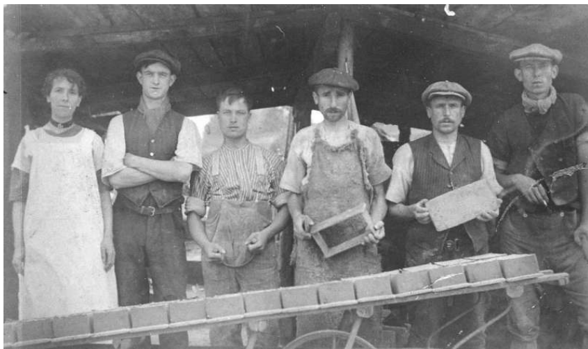
Brickmaking team Gillingham c1905