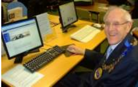
The Mayor of Medway, Councillor David Royle, was the first at the MALSC Open Day to go online and view the Medway Images online database

The annual Open Day (formerly Mince Pie Day) was held at MALSC on 16 th December 2009. At 10.45 am, the Mayor of Medway, Councillor. David Royle, cut the red ribbon to mark the official launch of the Medway Images Online Database. The launch of the database was followed in the afternoon by a talk by Chris Bull of Kent Libraries - Chalk Parish Folklore - What goes Bump in one Kentish Community .