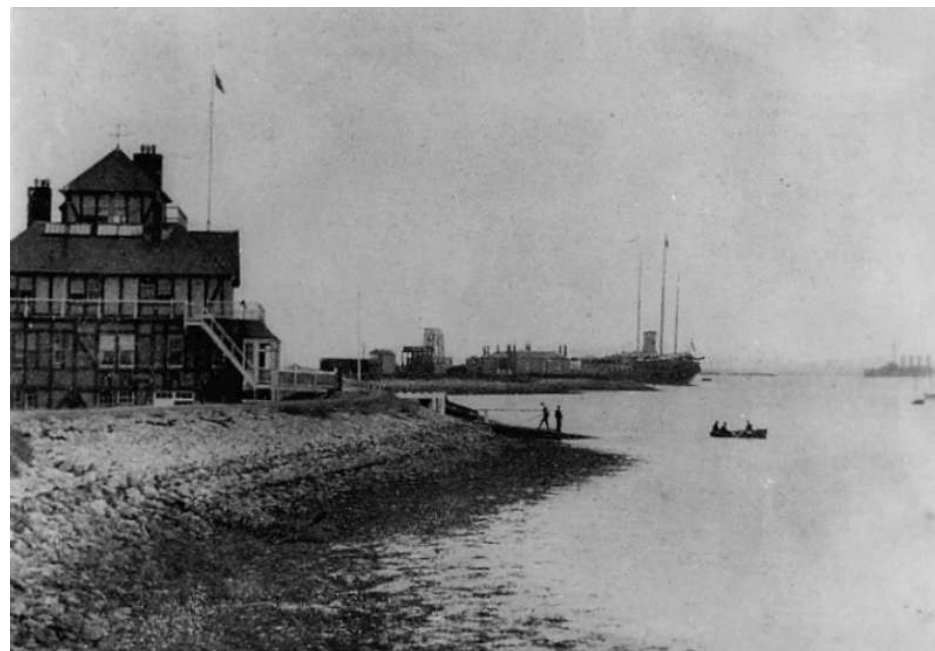
Port Victoria Hotel and Pier Isle of Grain - Royal Yacht Victoria and Albert visible