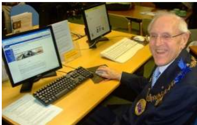
The Mayor of Medway, Councillor David Royle, was the first at the MALSC Open Day to go online and view the Medway Images online database

The annual Open Day (formerly Mince Pie Day) was held at MALSC on 16 th December 2009. At 10.45 am, the Mayor of Medway, Councillor. David Royle, cut the red ribbon to mark the official launch of the Medway Images Online Database. The launch of the database was followed in the afternoon by a talk by Chris Bull of Kent Libraries - Chalk Parish Folklore - What goes Bump in one Kentish Community .