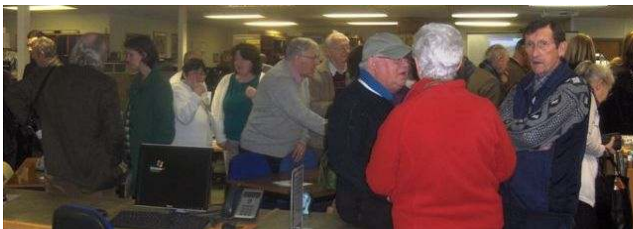
MALSC was packed on the annual Open Day