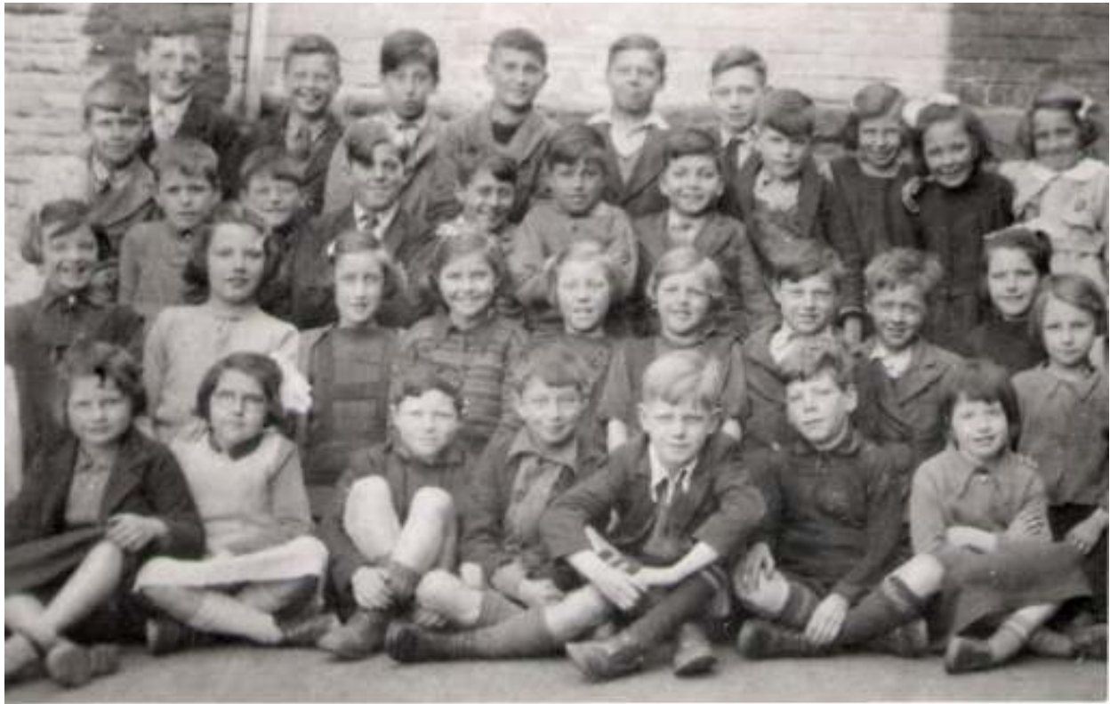
Boys and Girls Luton Council School at Abercarn, Wales (1940s) Picture Date: 1940s Luton