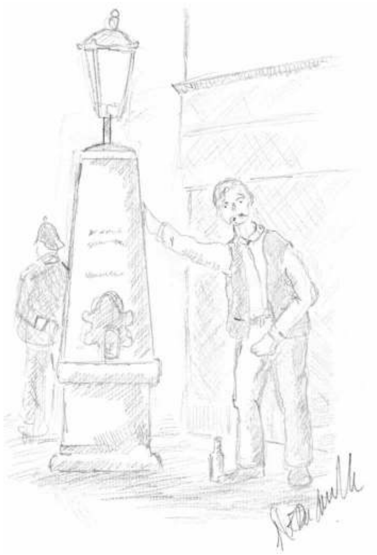
A drawing of the pump by Mick De Caville.