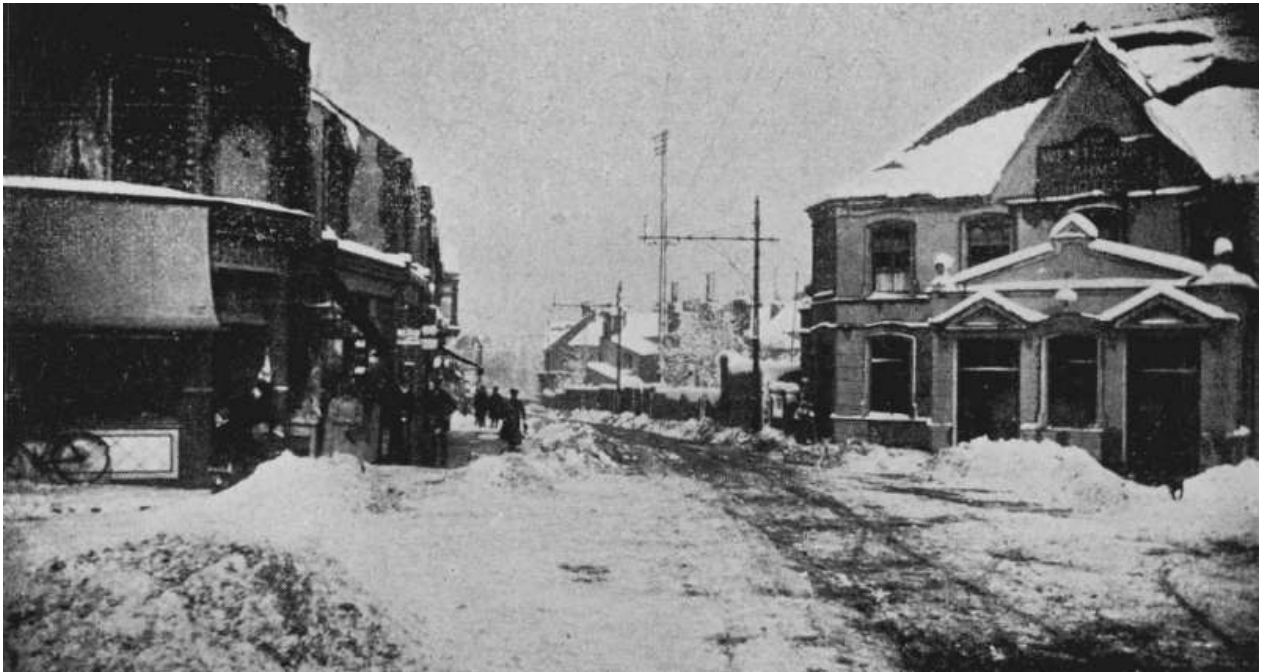
Canterbury Street Gillingham after snow 1909

Some samples from the Medway Images online database: