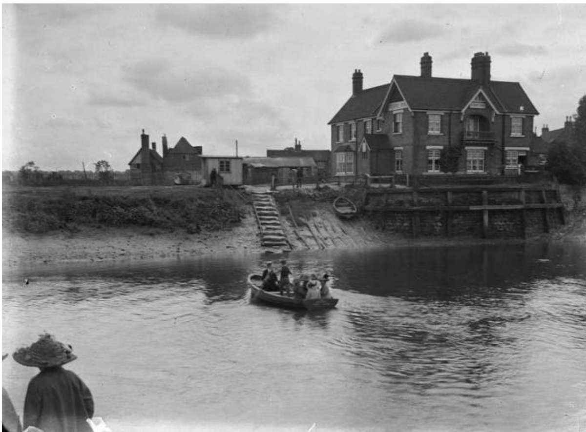
Ferry across River Medway at New Hythe (from Eccles). Ferry Inn now used as offices by papermill. c 1910.