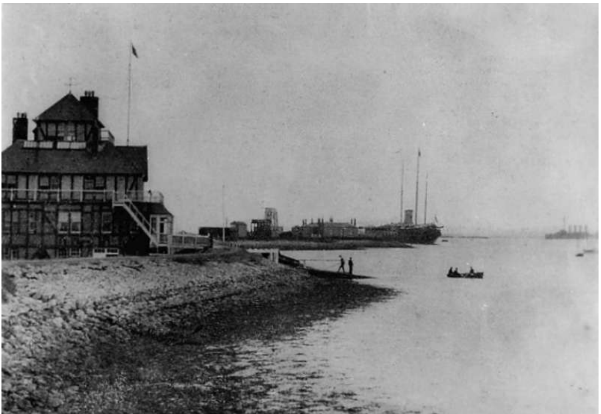
Port Victoria Hotel and Pier Isle of Grain - Royal Yacht Victoria and Albert visible