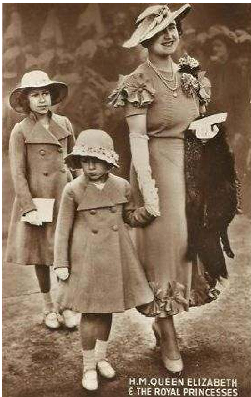
H.M. QUEEN ELIZABETH & THE ROYAL PRINCESSES