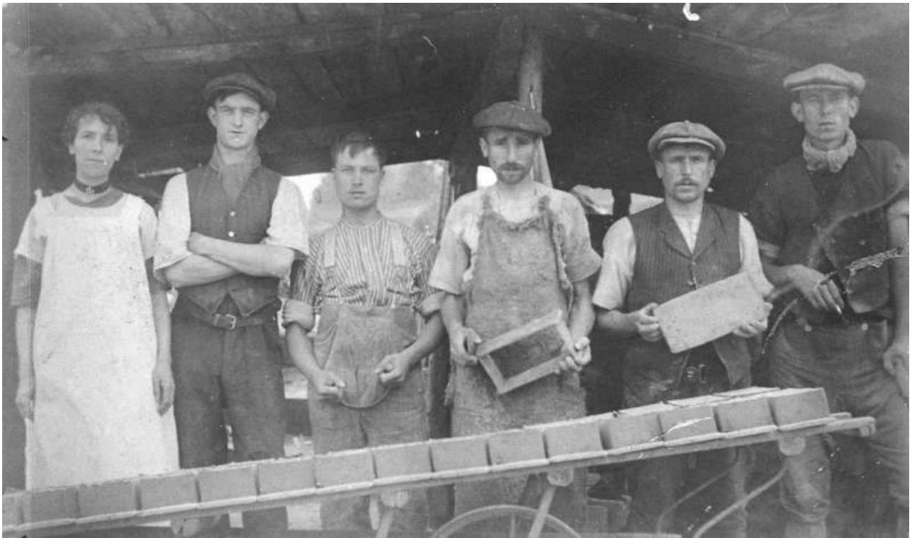
Brickmaking team Gillingham c1905