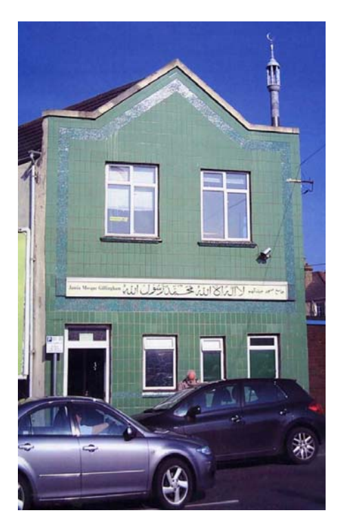
Kent Muslim Welfare Association, Gillingham Mosque

1930s, a social club for Borough Council employees up to 1961, then the Standard Kolster Club, a social and athletics club for Kolster factory employees, and last from 1967 the A'Becket Irish social club. On obtaining permission, the building became the Gillingham Mosque and in 1976 the organisation was renamed, The Kent Muslim Welfare Association.