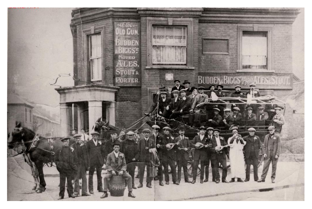
A possible May Day outing from Strood; from the Medway Archives and Local Studies Couchman Collection.

Watling Street, Strood Hill or London Road (A2 Trunk Road), Strood. Copy of photograph of group of working men, half standing, half on board horse-drawn charabanc and all facing camera, and most wearing cloth caps and carnations, one man wearing top hat sitting on beer barrel, others wearing bowler and other hats, some smoking cigarettes, three playing mandolins, one playing a flute and wearing ankle length smock and large floral hat, posing in front of London Road elevation of The Old Gun Inn, no. 1 London Road, Strood. Also showing in left distance range of buildings on east side of Cuxton Road and in left middle-ground two women standing in porch of public house, one wearing blouse and neck tie, and on elevation of building sign boards advertising Messrs. Budden and Biggs' noted ales, stout and porter. Possibly a May Day outing or outing for patrons of the public house, a local friendly society, trades union branch, co-operative society or working men's club. c.1910 p.34 (U)